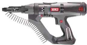
AUTO-FEED CORDED SCREWDRIVER SENCO MODEL DS235-AC-5,000 RPM CONTACT: 1-515-986-5287 - SOUTHERNCARLSON