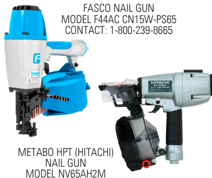
FASCO NAIL GUN MODEL F44AC CN15V-PS65 CONTACT: 1-800-239-8665